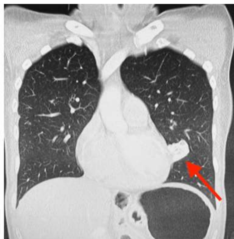
Figure 4: CT Chest demonstrating the patient's left lower lobe pulmonary chondroma, indicated by the red arrow.