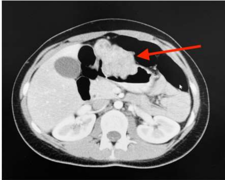
Figure 1: CT Abdomen scan demonstrating polypoidal mass arising from the lesser curve of the anterior stomach wall, indicated by the red arrow.

adding to the suspicion of a diagnosis of CT. Complete resection was achieved with a partial gastrectomy, hepatectomy and pancreatectomy, and she was placed under the care of a medical oncologist and commenced on oral Imatinib 400mg daily.